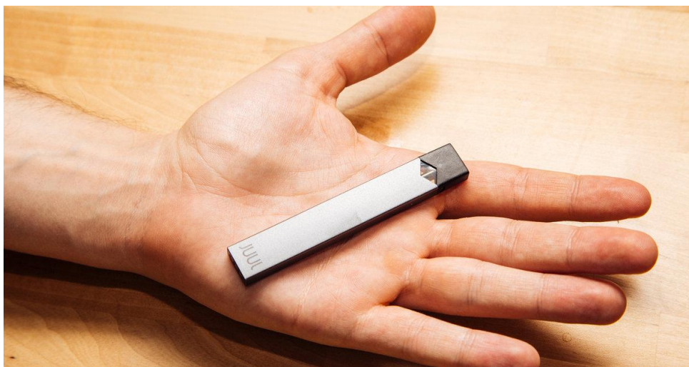
Read related story here: http://www.kansascity.com/news/local/article171369972.html