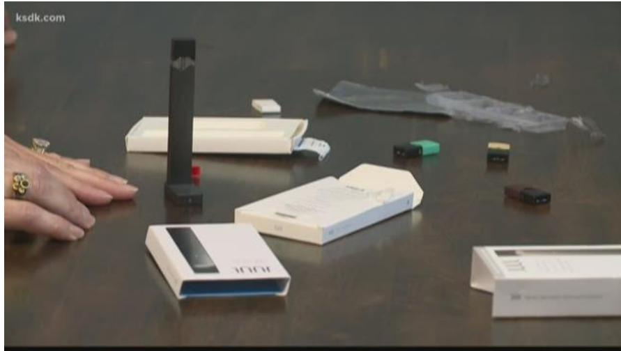
Read/Watch related story: http://www.ksdk.com/article/news/health/juuling-the-new-high-tech-fad-among-teens/493742982